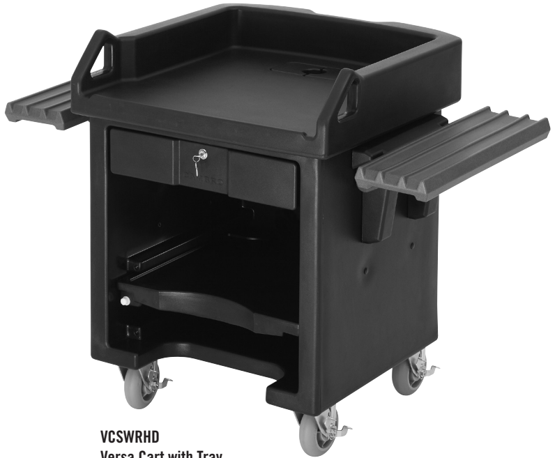
VCSWRHD Versa Cart with Tray Rails shown with optional heavy-duty casters.